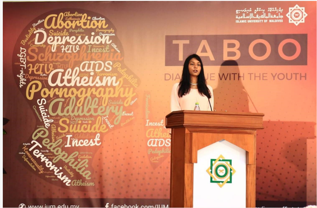
♦ Minister of Gender & Family delivers the opening remarks

"Taboo" programme aims to enable critical and constructive discussions on sensitive issues faced by today's youth, such as the issue of radicalization and recruitment of youth for violent activities, from contemporary, scientific and Islamic perspectives. The IUM aims to conduct sessions of this program every 2 months targeting youth of the 18-25 age group.