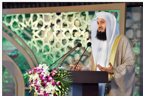
♦ Mufti Ismail Menk

Mufti Menk has given lectures in Addu City and Male especially targeting the youth.