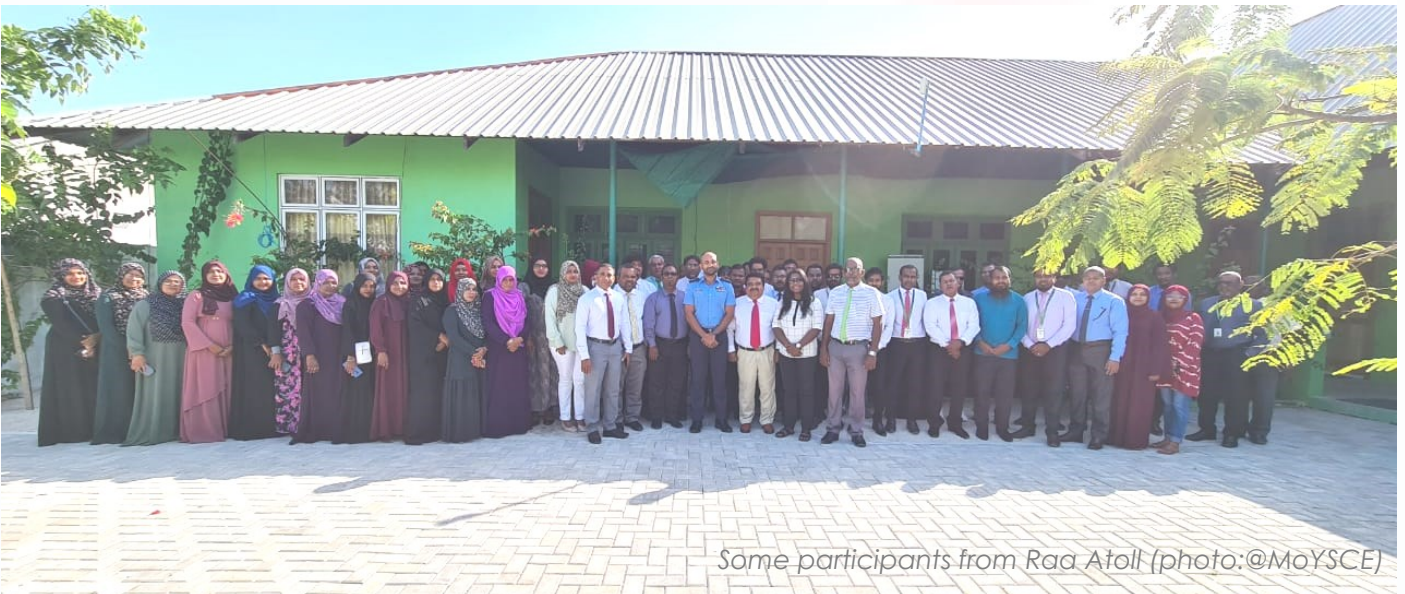
Some participants from Raa Atoll

Ministry of Youth, Sports and Community Empowerment in collaboration with NCTC conducted a series of “Hafthaares” programs in Vaavu, Raa, and Haa Dhaal Atolls. The program in Vaavu Atoll was held in V.Felidhoo in May, while the program in Raa Atoll was conducted in R.Ungoofaaruu in June and the program in Haa Dhaal Atoll was conducted in HDh.Hanimaadhoo in August.