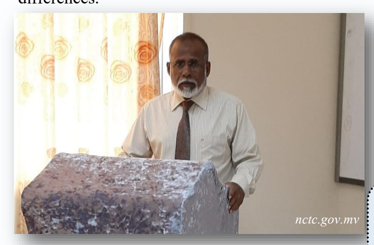
Dr. Ibrahim Zakariyya Moosa, the Vice Chancellor of Islamic University of Maldives

The aim of the workshop was to educate and enhance the role of education sector in national efforts to prevent spread of Violent Extremism through enhancing resilience to issues of ideological differences, promotion of peace, respect, and tolerance. The workshop focused on addressing the issues of violence and societal divides emanating from ideological differences.